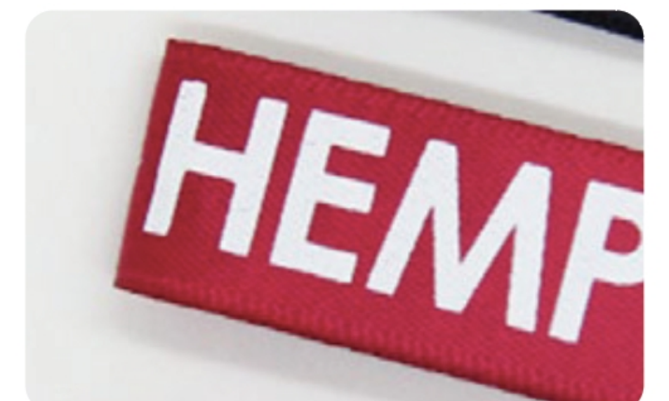
Thermal transfer printing